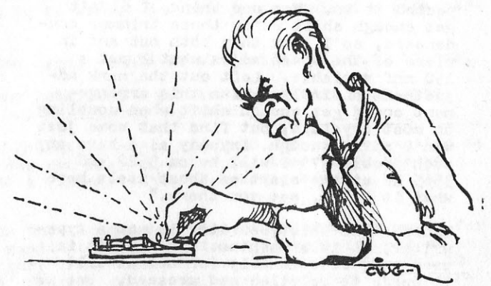
"Lets see that damned teletype work through this."

"I guess that will fix them," said one of the CW men on our channel who had been sending "V's" for about a half hour. This is a problem that may be with us for some while. Even so, it is now quite apparent that CW QRM has been highly over-rated. I have seldom lost copy due to CW, even though it seems much stronger than the TT.