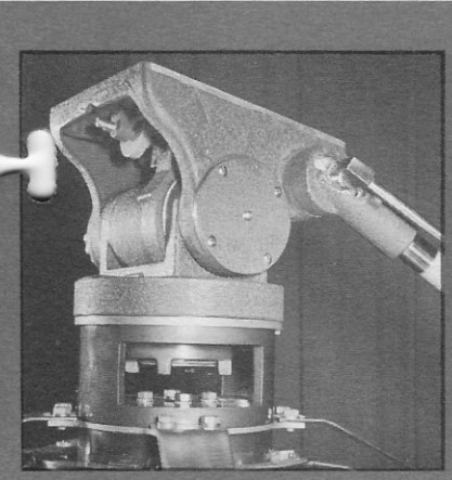
Head is easily attached or removed. Mounting nut accessible through opening at top of column.

Camera column can be locked down to allow camera removal without removing counter-balance.