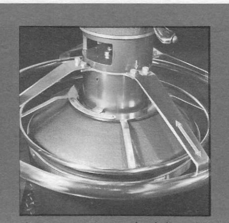
Arrows on steering wheel show direction of wheels. Lower ring locks column and controls drag.