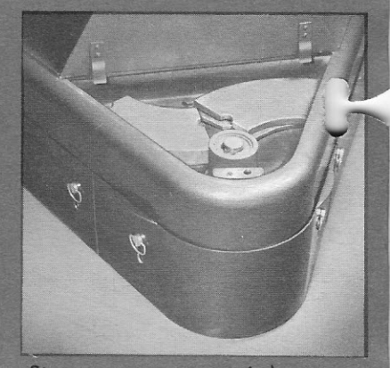
Storage compartments in base provide convenient space for extra lead weights, tools, etc.