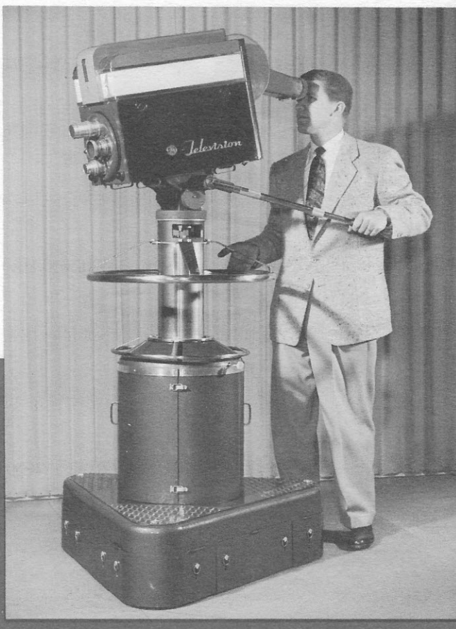
Counterbalanced camera is easily raised or lowered by light pressure on steering wheel.