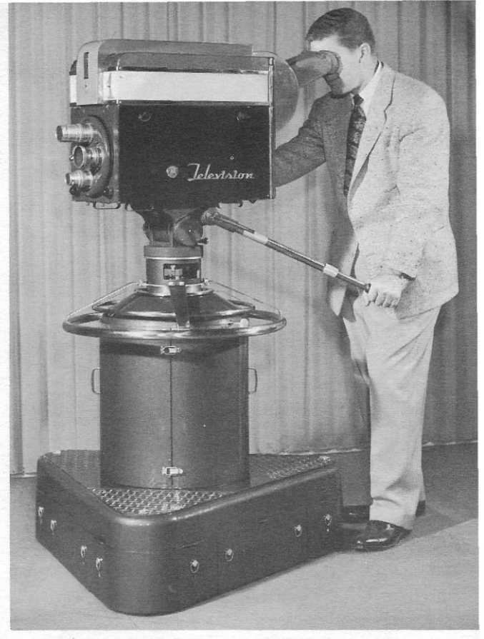
Easily operated by one man. Offers maximum convenience and mobility. Shown here in low position.