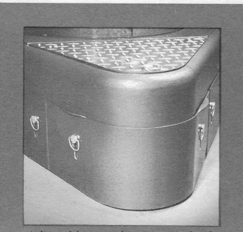
Adjustable guards prevent wheels from running into cables. Corner step plate is shown above.